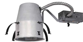
12" L x 4¼" W x 5½" H Ceiling cutout: 4¾" diameter