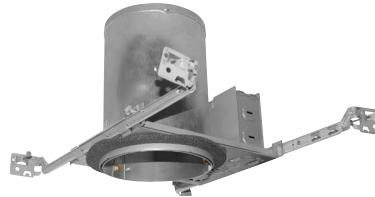
11¼" L x 6¾" W x 7½" H Ceiling cutout: 5½" diameter