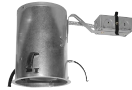
12½" L x 5¾" W x 7½" H Ceiling cutout: 5½" Diameter